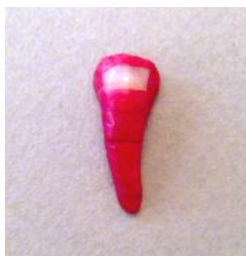
Figure 1. Divided tooth with the test area. The surrounding tooth surface was coated with nail varnish

The Mann-Whitney nonparametric test was used for statistical analysis.