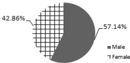
Figure 3: PRGF according to gender

Of the 51 patients with PAT, 26 (51%) were females and 25 (49%) were males. The mean age of PAT patients was 47.92 \pm 14.39 years, with a range of 21–81 years. Of the PRGF patients, 6 (42.9%) were females and 8 (57.1%) were males. The mean age of PRGF patients was 45.07 \pm 13.67 years, with a range of 25–66 years. For PAT and PRGF, no statistically significant differences were found with gender ( p = 0.59 ). PAT and PRGF may be considered the mastoid