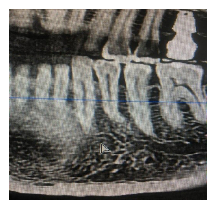
Fig1: an example mesiodistal dilaceration

of deviation of angle was considered mild, 41 to 60 degrees was moderate, and 61 degrees and more was severe(11) (Fig1&2). All of the mentioned measurements were done by two oral and maxillofacial radiologists. Interobserver agreement was reported as 96% (Kappa test).