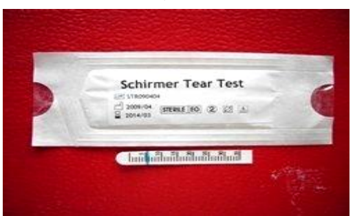
Figure 1. The pack of Schirmer tear test

This descriptive study was performed on 33 patients suffering from head and neck cancers who were treated in oncology and radiotherapy department of Imam Khomeini hospital, Tehran, Iran in 2009. Patients were asked to give their consent before registering their information and measuring the saliva flow rate. The patients' information registered in special forms included first name, surname, gender, age, history of systemic diseases, taking any medicine or addictive drug, and the type of cancer. The patients included in the study suffered from head and neck cancers, had not had received radiotherapy before, and had not had history of any disease affecting the salivary glands. Radiotherapy regimen which was scheduled for 6 weeks, consisted of daily exposure of 180-200cGy, five days per week. The saliva flow rate was measured four times: before treatment, two weeks and four weeks after treatment and at its completion, using Schirmer test paper [purchased from Chauvin pharmaceutical Ltd. (Ramford, Essex, UK)] in 5 minutes.