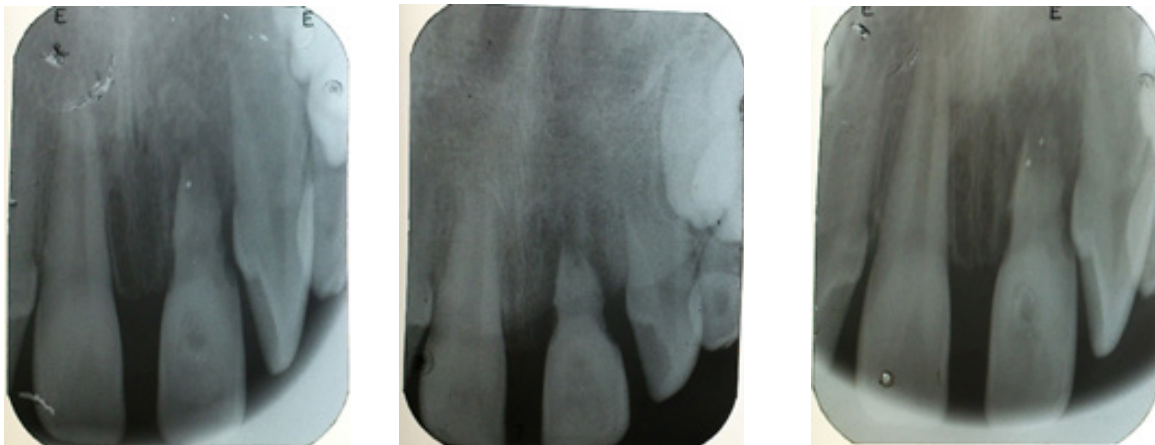
Figure 4. Interim root canal dressing with calcium hydroxide during the first year after initial visit