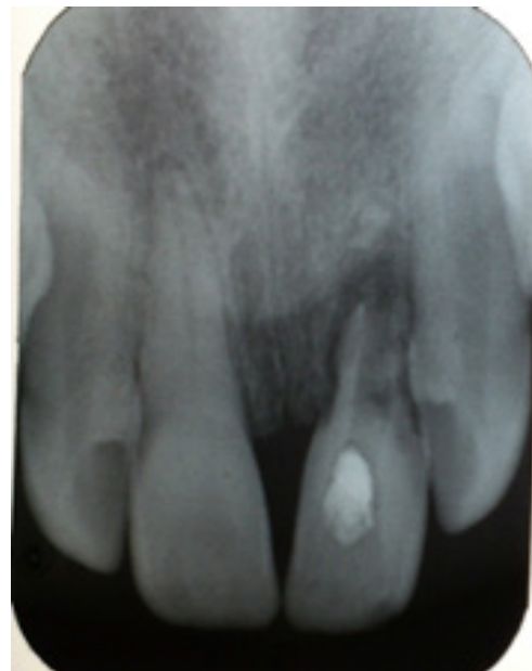
Figure 6. Root canal dressing with Triple Antibiotic Paste (TAP)