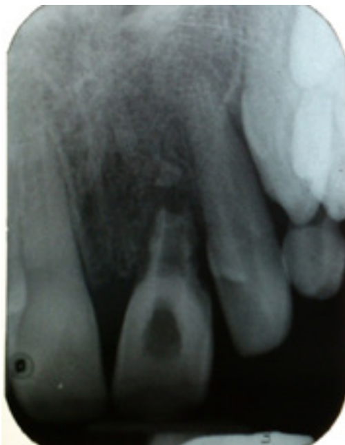
Figure 5. 2-year follow-up radiograph

In closed apex teeth, prophylactic endodontic therapy should be undertaken within 7-10 days after replantation [8]. However, for teeth with wide open apex, careful observation is recommended as there is a chance for revascularization. If any signs of necrosis such as root resorption are diagnosed, root canal therapy should be per-