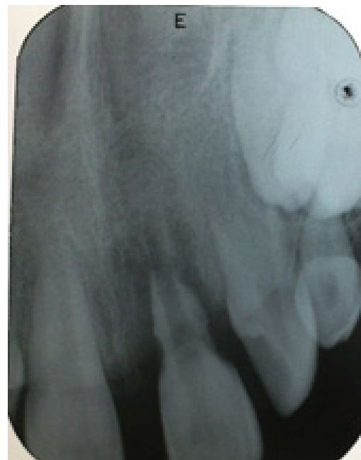
Figure 3. 6-week follow-up radiograph showing advanced external resorption

Tooth avulsion most often occurs in the anterior region of the maxilla, compromising a patient's esthetic,