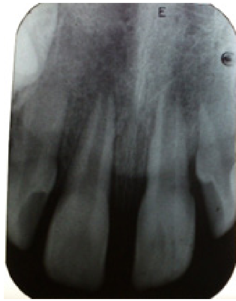
Figure 2. 3-week follow-up radiograph

The calcium hydroxide paste was replaced three times during a year because the resorption process was not arrested (Figure 4). Unfortunately, the patient failed to present as scheduled for follow-up appointment during the second year after the initial visit. After two years, the patient came back to the clinic. The tooth coronal seal was compromised. An intra-oral periapical radiograph was taken (Figure 5). According to the consultation with the endodontic department of Hamadan University of Medical Sciences (Hamadan, Iran), the tooth 21 was hopeless due to extensive root resorption and possible root perforation. However, with the parents' consent, the calcium hydroxide paste was removed and the canal was filled with Triple Antibiotic Paste (TAP) containing metronidazole, ciprofloxacin, and minocycline. The paste was changed monthly for a period of 3 months. After 3 months, the paste was changed for the last time, and it was then allowed to remain in the tooth. The chamber was sealed with resin-modified glass ionomer cement (Figure 6). Follow-up radiograph after 5 years revealed that the external root resorption had been arrested and replacement resorption was observed (Figure 7). In this