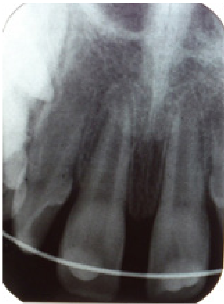
Figure 1. Post-splinting radiograph