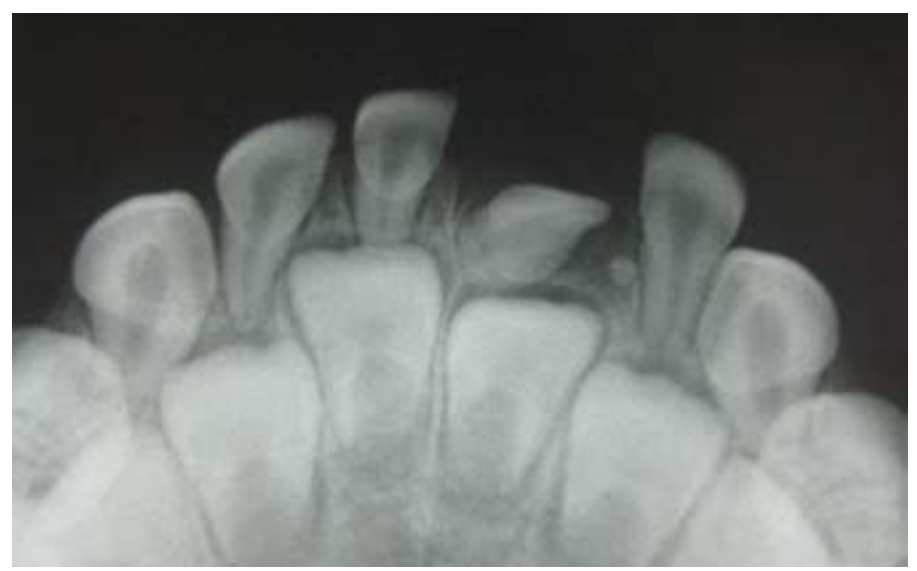
Figure 3. The two-year follow-up radiograph showed no explicit expansion. Small opacity was present on the lateral wall of the lesion.