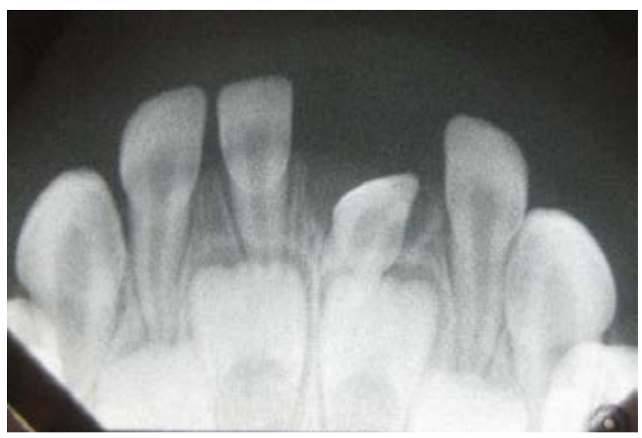
Figure 2. Periapical radiograph of the mandibular incisors, showing a well-defined, corticated pericoronal radiolucency associated with the left central incisor.