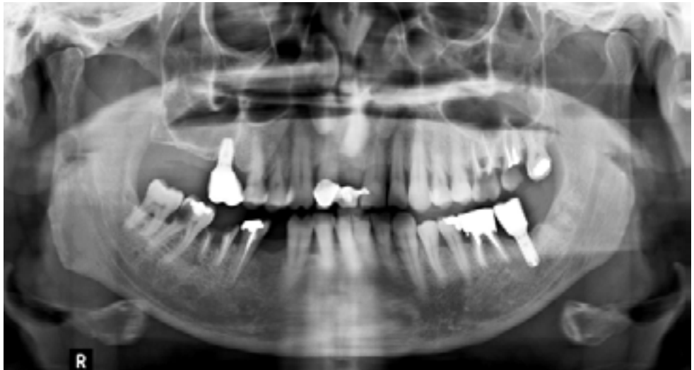
Figure 1. A panoramic radiograph shows a well-defined unilocular radiolucent lesion in the posterior and upper one-third of the mandibular ramus under the condylar neck.

According to the radiologic and clinical examinations, the diagnosis of parotid Stafne defect was confirmed. No additional treatments except scheduled follow-up appointments were performed.