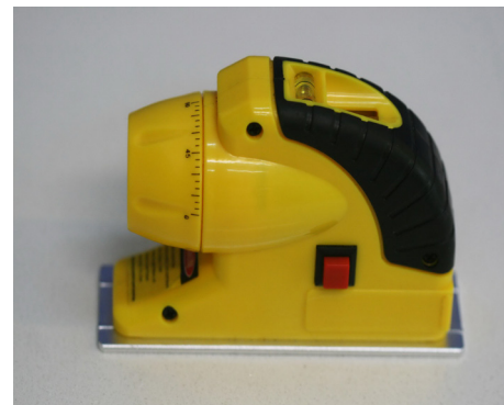
Figure 1. The laser level used for the measurement of the inclinations

Sometimes, while adjusting a cast orientation in one plane, the other orientation may change. For avoiding such problems, the alignment of the laser line is kept along the first adjusted line, and the tilt of the cast is changed simultaneously in the other plane.