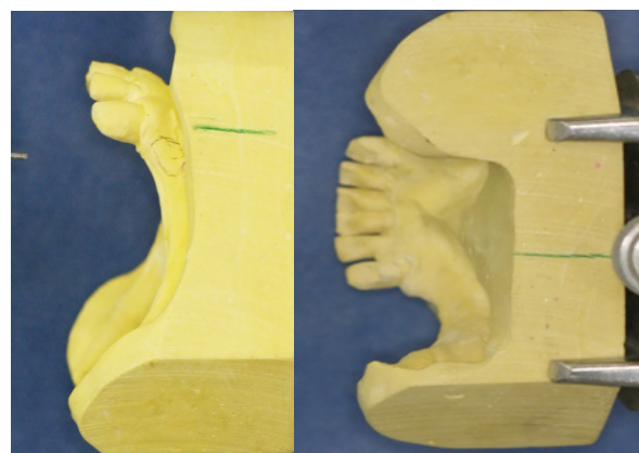
Figure 2. Two straight lines are marked on the lateral walls of the cast with a pencil (a, left photo; b, right photo).