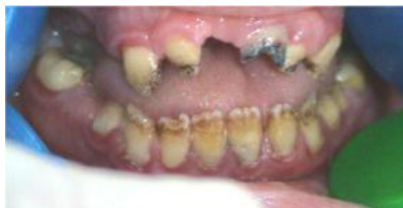
Figure1. Clinical view Dentin Dysplasia Type I with Hypomature Amelogenesis Imperfecta in an 18-year-old Girl

In panoramic view, the bone structure and trabeculation were normal. The teeth numbers; 18, 28, 38, 37, 47 were impacted without adequate root development. The teeth number 27 and 48 were missed. The entire teeth had short roots and pulp obliteration. The enamels of entire teeth were thin and on some surfaces of posterior teeth were lost. The overall findings were combination or concurrent dentin dysplasia type I and hypoplastic type of amelogenesis imperfecta. The alveolar bone loss exists in some areas (Figure 2).