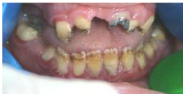
Figure1. Clinical view Dentin Dysplasia Type I with Hypomature Amelogenesis Imperfecta in an 18-year-old Girl

In panoramic view, the bone structure and trabeculation were normal. The teeth numbers; 18, 28, 38, 37, 47 were impacted without adequate root development. The teeth number 27 and 48 were missed. The entire teeth had short roots and pulp obliteration. The enamels of entire teeth were thin and on some surfaces of posterior teeth were lost. The overall findings were combination or concurrent dentin dysplasia type I and hypoplastic type of amelogenesis imperfecta. The alveolar bone loss exists in some areas (Figure 2).