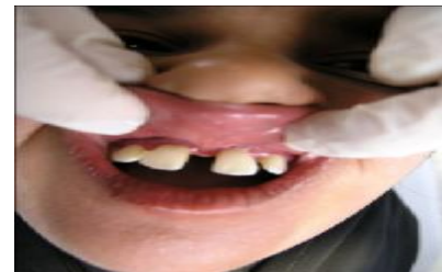
Figure 3. Appearance of gingival erythema, edema and severe periodontal disease