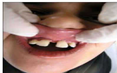
Figure 3. Appearance of gingival erythema, edema and severe periodontal disease