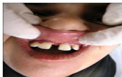
Figure 3. Appearance of gingival erythema, edema and severe periodontal disease