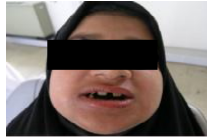
Figure 2. Dryness of perioral skin

According to intraoral examination, the gingiva was edematous and hyperemic (Figure 3). Periodontitis was revealed in four quadrants. Radiographic examination showed moderate to severe alveolar bone loss. "Hang in air" appearance was evident for some teeth (Figure 4).