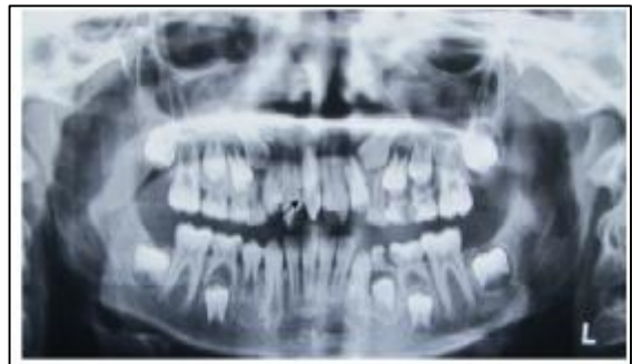
Figure 1. Erupted mesiodense in the anterior portion of the maxilla

Figures 1 and 2 reveal two dental anomalies that were detected in the present study.