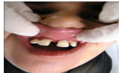
Figure 3. Appearance of gingival erythema, edema and severe periodontal disease