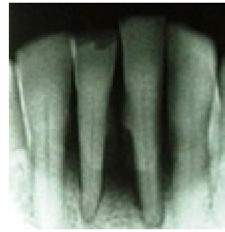
Journal of Dentomaxillofacial Radiology, Pathology and Surgery