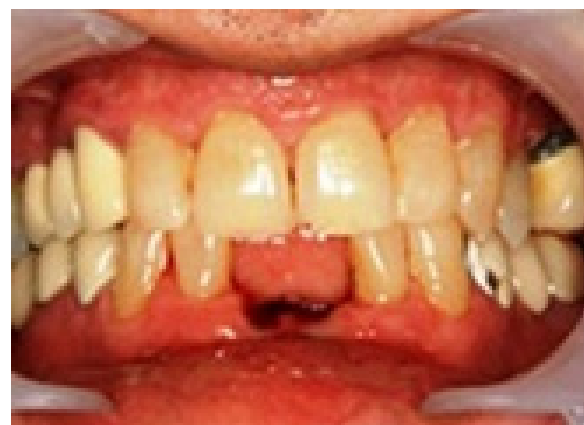
Journal of Dentomaxillofacial Radiology, Pathology and Surgery

The teeth were extracted under infiltration anesthesia without much trauma to the alveolar bone (Figure 3). Following that, root resection was done just below the marked area at the level of entrance of the apical portion of the root to the gingiva (Figure 4). The radicular pulp tissue was removed and canal was filled with light cured flowable composite resin (Filtek Supreme flowable composite, 3M, ESPE, St. Paul, USA). A modified ridge lap design was given to the apical portion of pontics to facilitate both oral hygiene and appearance of emergence profile. Then, position of the natural pontics was tried. Afterwards, a groove were made on lingual portion of pontics.