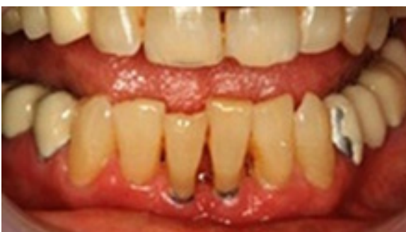
Journal of Dentomaxillofacial Radiology, Pathology and Surgery

A 59-year-old man with complaint of gingival recession of mandibular central incisors was reported to dental school clinic. After clinical and radiographic examination, gingival recession and bone loss were revealed around mandibular central incisors (Figure 1 and 2). The crowns had the same color, shape, and translucency of the adjacent lateral incisors. The patient oral hygiene