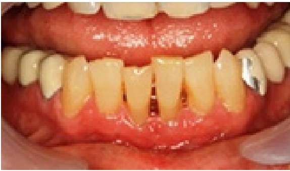
Journal of Dentomaxillofacial Radiology, Pathology and Surgery