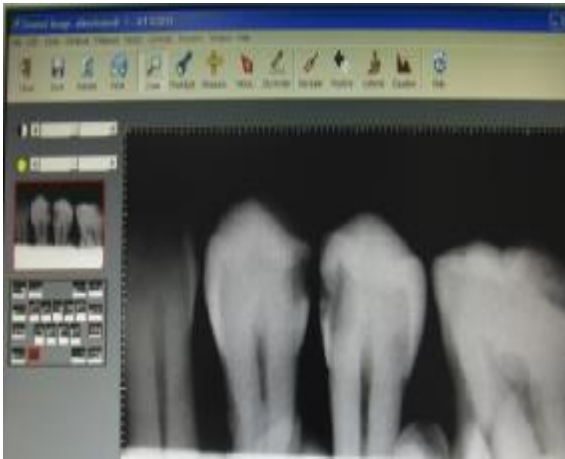
Figure 2. An example of a digital image evaluated in the study

Two oral and maxillofacial radiologists with at least 8 years of experience independently evaluated all the images. The film based radiographs were interpreted using a conventional view box, which was masked to remove all ambient light around the radiographs. Images from digital system were displayed on a 17 inch monitor (Ben Q, Taipei, Taiwan) with a resolution of 1024×768 and a grayscale of 0-255. (Figure 2) Digital images were displayed and evaluated employing CMOS software. Observers viewed the images and recorded their diagnosis using ordinal caries depth rating scales: 0=no caries, 1=caries restricted to enamel; 2=caries reaching to the dentino-enamel junction; 3=caries extending into the dentin.