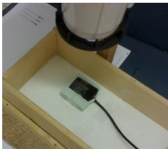
Figure 1. Prefabricated apparatus for positioning of image receptor and PID

them. The teeth were evaluated clinically and radiographically for the presence of proximal caries. The roots of the teeth were embedded in plaster and arranged in groups of four. In each block, we used two selected premolars; one canine and one molar tooth for making proximal contact surface, but only premolars were considered in this study. A total of 120 proximal surfaces were available, including surface with no decay and with carious lesions of varying depth. An apparatus was fabricated to allow for a constant spatial relationship among the x-ray source, the teeth and the receptor (Figure 1). The angulation and position of central ray was fixed bringing the the sensor against a ring of film holder (RWT, regular, Ellwangen, Germany) by the end of the PID (the position indicating device). The distance from the sensor to film /sensor was 40cm. A 0.5cm thick glass plate was used for the simulation of x-ray absorbing and scattering properties of soft tissue cheek. The teeth were imaged with both conventional and digital technologies. The conventional radiographs were obtained using F-speed film (flow x-ray, FV-58, NY, USA) whereas the digital images using CMOS sensor (Schick, Long Island, NY, USA). Both recording devices were exposed to x-rays generated by a planmeca unit (Planmeca, Helsinki, Finland) operating at 70 kVp and 8 mA. The optimal exposure time for each radiographic method was established during a pilot study.