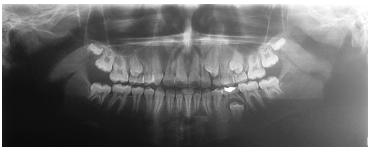
Figure 1. Panoramic view reveals opacification of canine fossa and premolar region in the left side of maxilla.

Microscopic view determined irregular shaped woven bone without osteoblastic rim in a cellular fibrous stroma. Artifactual cleft around the bony trabeculae was present and there is no evident of necrosis, hemorrhage, atypia, mitotic figure or malignancy. Histopathologic findings revealed fibro-osseous lesion, compatible with clinical and radiographic findings of fibrous dysplasia.