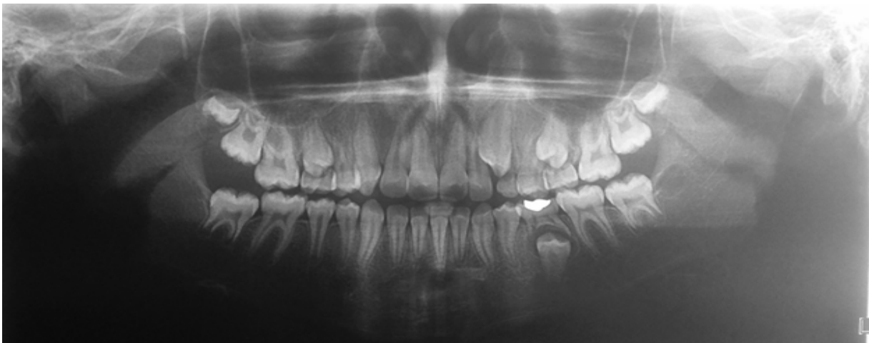
Figure 1. Panoramic view reveals opacification of canine fossa and premolar region in the left side of maxilla.

Microscopic view determined irregular shaped woven bone without osteoblastic rim in a cellular fibrous stroma. Artifactual cleft around the bony trabeculae was present and there is no evident of necrosis, hemorrhage, atypia, mitotic figure or malignancy. Histopathologic findings revealed fibro-osseous lesion, compatible with clinical and radiographic findings of fibrous dysplasia.