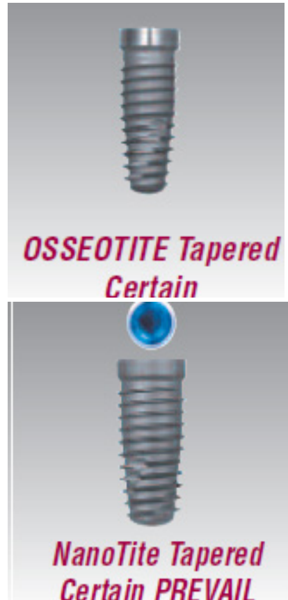
Figure 1- Biomet 3i dental implants

sertion of the implant, clinical and radiographic examination of the patients was performed by a single clinician. After confirming the ideal prosthetic and anatomical condition of the surgical site, the implants were replaced in the edentulous area.