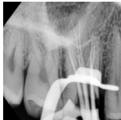
Figure 3. Placement of master cones in tooth #14.