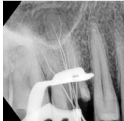
Figure 2. Removal of gutta-percha and detection of the missed canal in tooth #14.

cedure. Thereafter, calcium hydroxide (Daroupakhsh, Tehran, Iran) was placed in the canals, and the access cavity was sealed using Cavit (ESPE, Seefeld, Germany). One week later, the tooth was found to be asymptomatic, and the canals were obturated with a cold lateral condensation technique using gutta-percha (Gapadent, Hamburg, Germany) and AH plus sealer (Dentsply, Maillefer) (Figures 3 & 4). The tooth was temporarily sealed using Cavit, and the patient was referred for permanent restoration (Figure 5).