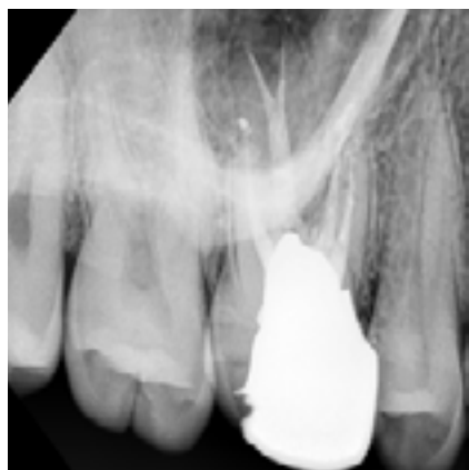
Figure 5. Final restoration of tooth #14.