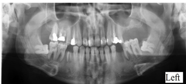
Figure 2. Type II, Pseudo articulated SP or apparently joined elongated styloid process in left side. Type III or Segmented ESP (interrupted segments of mineralization) in right side