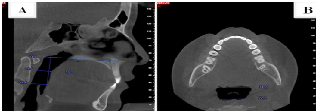
Figure 1. (A) sagittal cross section through mid sagittal plane shows the superior & inferior border of region of interest. (B) Axial cross section through epiglottis show area of region of interest at the level of epiglottis.

The CBCT axial reconstruction plane was re-oriented for each subject based on three reference planes: axial, coronal, and sagittal. Airway volumes were determined from the summation of the airway area by using 1 mm axial CBCT slices over the vertical height of the pharyngeal airway determined from the lateral cephalograms. The skeletal malocclusions of the subjects were then classified as per Angle’s classification (Classes I–III) using the lateral cephalograms. Thereafter, the following measurements of the pharyngeal airway were obtained: (a) airway area of the region of interest from the lateral cephalograms; and (b) airway volume over the same of region of interest from the CBCT scan, with all segmented 3D volumes included in this study.