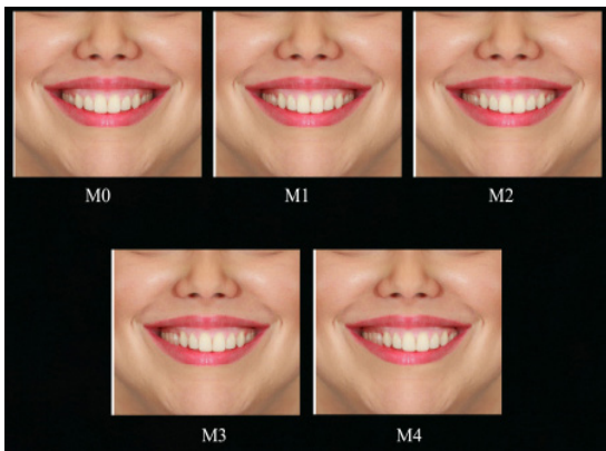
Figure 1. Extraoral photographs from alteration group 1 displaying dental midline shift by 4mm to the right. M0, unaltered image; M1–4, progressive shift in dental midline by increments of 1 mm towards the right.

Five sizes of the dark spaces in the buccalcorridors: B5 and B10, 5% and 10%, respectively (narrow buccal corridor), B15 and B20, 15% and 20%, respectively (average buccal corridor);andB25, 25% (wide buccal corridor)