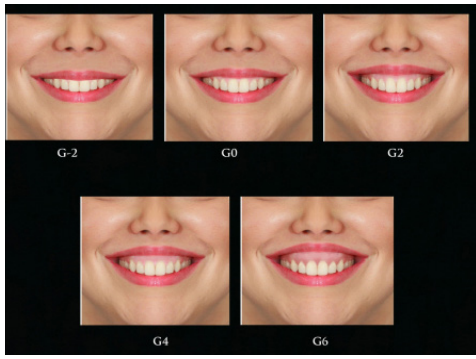
Figure 4. Extraoral photographs from alteration group 3 displaying maxillary anterior gingival display. G-2, covering 2 mm of the teeth from the margin of the gingiva; G0, at the margin of the maxillary central incisors; G2, 2 mm distance between the gingiva and the lip, using the labial gingival margins of maxillary central incisors as reference (unaltered image); G4, 4 mm distance between the gingiva and the lip; and G6, 6 mm distance between the gingiva and the lip