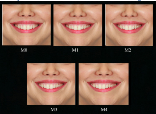
Figure 2. Extraoral photographs from alteration group 1, displaying dental midline shift by 4 mm to the left. M0, unaltered image; M1–4, progressive shift in dental midline by increments of 1 mm towards the left.

Results from the ANOVA test showed that orthodontists were less tolerant in their evaluation of dental midline discrepancies, and rated more than 1 mm shifts as less attractive, whereas, prosthodontists, esthetic and operative dental specialists, and general dentists found smiles with more than 2 mm shift as unattractive. A midline shift higher than 3 mm was perceived as unattractive by the maxillofacial surgeons in this study (Tables 1, 6).