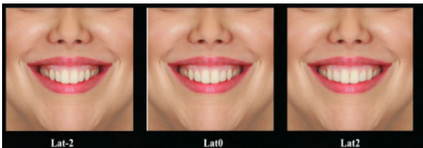
Figure 6. Extraoral photograph from alteration group 5 displaying the Golden proportion. Lat0, unaltered image; Lat-1, 1 mm decrease; and Lat1, 1 mm increase in lateral incisor's width.

As illustrated in Table 2, mean VAS scores for altered images in alteration group 2 (size of buccal corridor) revealed the average buccal corridor (mean score of B15 and B20) as the most preferred size for an esthetic smile; the orthodontists were the most critical of this variable, when compared the dentists in the other groups. Table 3 shows the mean analogue scores for altered images in alteration group 3 (gingival display). No gingival display without covering the tooth was considered the most attractive among all groups. Moreover, this variable had the highest score when compared with the rest of the variables in the study (Figure 7). Table 4 shows that the smile with the narrow lip (2 mm decrease in height of upper lip vermilion) was considered as the most esthetic among all groups. Table 5 shows the mean VAS scores for the alteration group 5, and compares the perception of the existence of golden proportion in the anterior teeth among the groups; orthodontists considered the smile in unaltered photographs as most attractive, whereas, the dentists in the other groups preferred the smile with a 1 mm increase lateral incisor width.