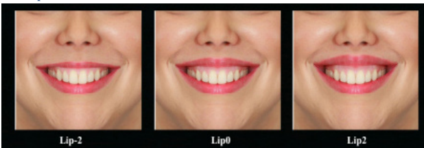
Figure 5. Extraoral photographs from alteration group 4 displaying size of the upper lip vermilion border. Lip0, unaltered image; Lip-2, 2 mm decrease; and Lip2, 2 mm increase the height of vermilion border