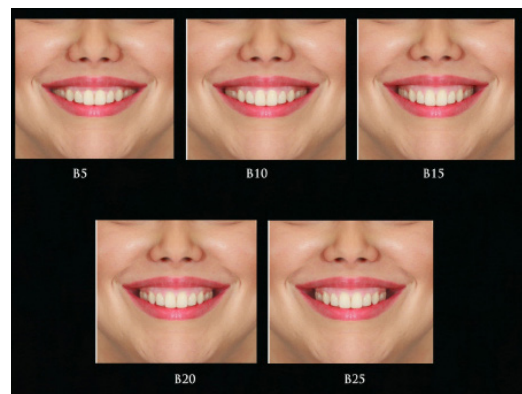
Figure 3. Extraoral photographs from alteration group 2 displaying buccal corridor area. Five sizes of dark space in the buccal corridors area shown: B5 and B10, 5% and 10%, respectively (narrow buccal corridor); B15 and B20, 15% and 20%, respectively (average buccal corridor), and B25, 25% (wide buccal corridor)

Results from the ANOVA test showed that orthodontists were less tolerant in their evaluation of dental midline discrepancies, and rated more than 1 mm shifts as less attractive, whereas, prosthodontists, esthetic and operative dental specialists, and general dentists found smiles with more than 2 mm shift as unattractive. A midline shift higher than 3 mm was perceived as unattractive by the maxillofacial surgeons in this study (Tables 1, 6).